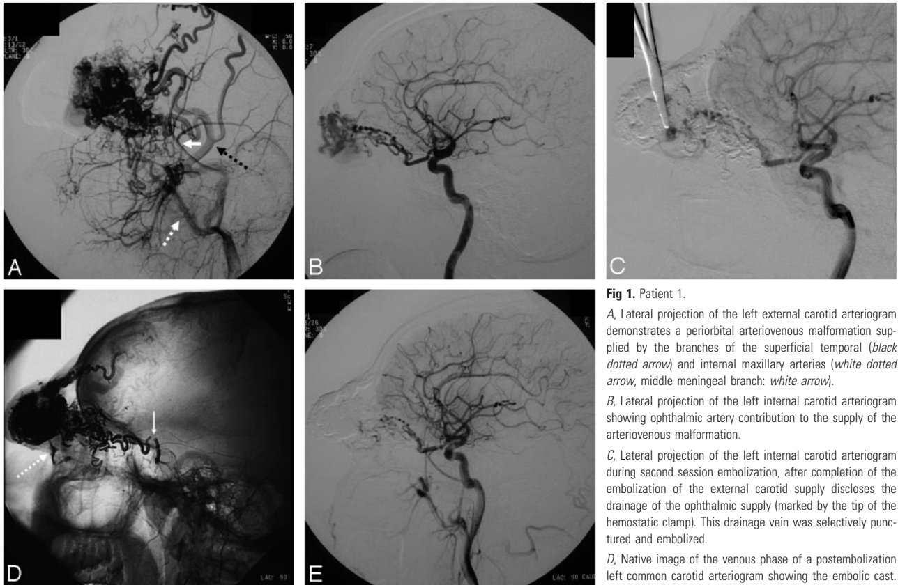
Fig 1. Patient 1.

A, Lateral projection of the left external carotid arteriogram demonstrates a periorbital arteriovenous malformation supplied by the branches of the superficial temporal (black dotted arrow) and internal maxillary arteries (white dotted arrow, middle meningeal branch: white arrow).