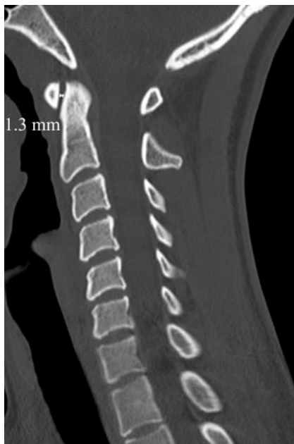
Fig 4. Midsagittal MDCT image of the craniocervical junction demonstrates the ADI, which is calculated by drawing a line from the posterior aspect of the anterior arch of C1 to the most anterior aspect of the dens at the midpoint of the thickness of the arch in craniocaudal dimension.