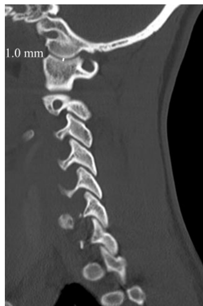
Fig 5. Sagittal MDCT image of the craniocervical junction demonstrates the AOI, which is calculated by drawing a line perpendicular to the articular surfaces of the occipital condyle and the lateral mass of C1. This line is drawn at the center of the articulation by correlating the sagittal and coronal images.

Our results demonstrated significant variances from the previously accepted normal values on plain radiographs for several of the methods used (Table 1). The BAI was found to be highly variable and difficult to reproduce on CT images with a large SEM, and a number of subjects measuring greater than the upper accepted norm of 12 mm. 2 When measuring the BAI, we found a large interexaminer and intraexaminer variability, often because of differences in how the PAL was drawn.