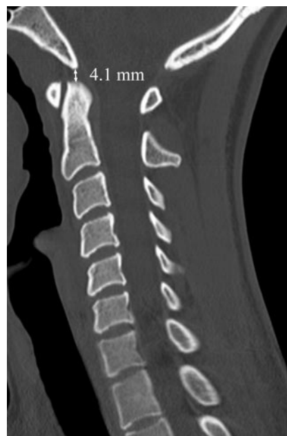
Fig 2. Midsagittal MDCT image of the craniocervical junction demonstrates the BDI as the distance from the most inferior portion of the basion to the closest point of the superior aspect of the dens.

erature. In addition, a second examiner repeated each of these measurements on 53 of the patients in our study group, to calculate interexaminer variability. Furthermore, one of the examiners performed each measurement 3 times to calculate intraexaminer variability on 57 of the patients. For interexaminer and intraexaminer comparisons, we used the intraclass correlation measures as described by Shrout and Fleiss. 8 We then calculated correlations for each of the 5 methods of measurement. Finally, we separated the data for male and female subjects and again performed the above calculations to evaluate for sex differences.