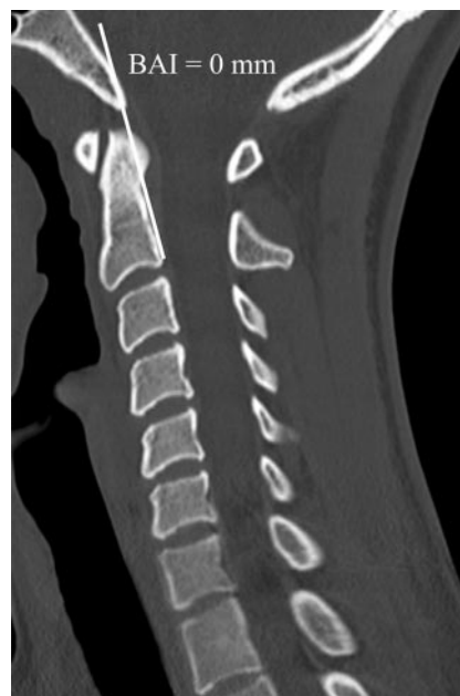
Fig 1. BAI. Midsagittal MDCT image of the craniocervical junction demonstrates the posterior axial line drawn along the posterior cortex of the body of the axis and extended cranially. The BAI is the distance between the basion and this line.

For each of the methods, we calculated the mean, SD, standard error of the mean (SEM), and range. Normal maximum values were defined as the value inclusive of 97.5% of the study population. After establishing the normal values, we compared these values to previously accepted data from plain radiographs in the lit-