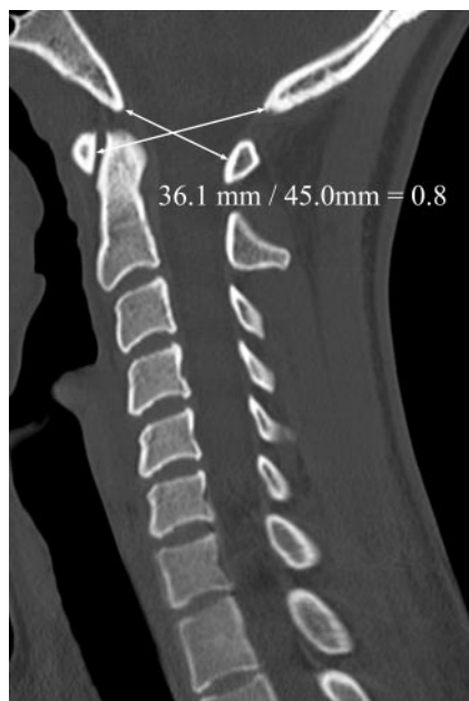
Fig 3. Midsagittal MDCT image of the craniocervical junction demonstrates the Powers ratio, which is calculated by dividing the distance between the tip of the basion to the spinolaminar line by the distance from the tip of the opisthion to the midpoint of the posterior aspect of the anterior arch of C1.