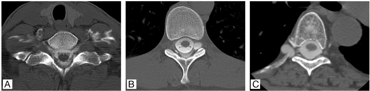
Fig 1. Postmyelography CTs showing (A) bilateral cervicothoracic CSF leaks without an associated meningeal diverticulum; B, Left thoracic meningeal diverticulum with an associated CSF leak; and C, right thoracic meningeal diverticulum without an associated CSF leak.