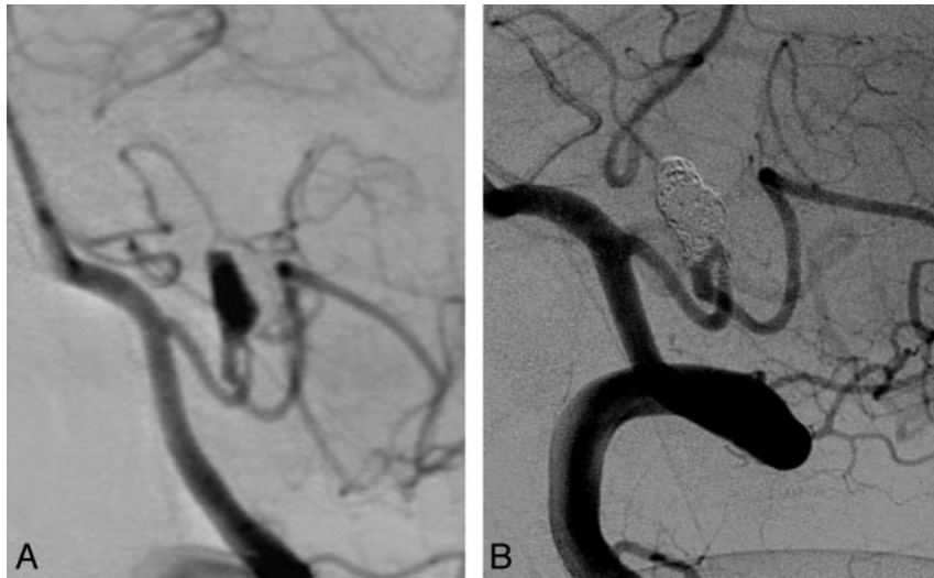
Fig 1. A 46-year old woman (patient 4; Table) experienced acute onset of headache. MR imaging and MR angiography showed a right-sided PICA aneurysm without any evidence of intracranial bleeding. In initial DSA (A), a 9- × 5.5-mm sidewall aneurysm was visualized in a tonsillomedullary segment of the right PICA. The artery is narrowed proximally and dilated distally to the aneurysm neck. A balloon occlusion test was performed with indeterminate findings. The aneurysm was treated by endosaccular coiling with parent artery preservation. The initial occlusion grade was incomplete, but after retreatment a complete occlusion was achieved, and it has remained stable during follow-up (Fig 2B).