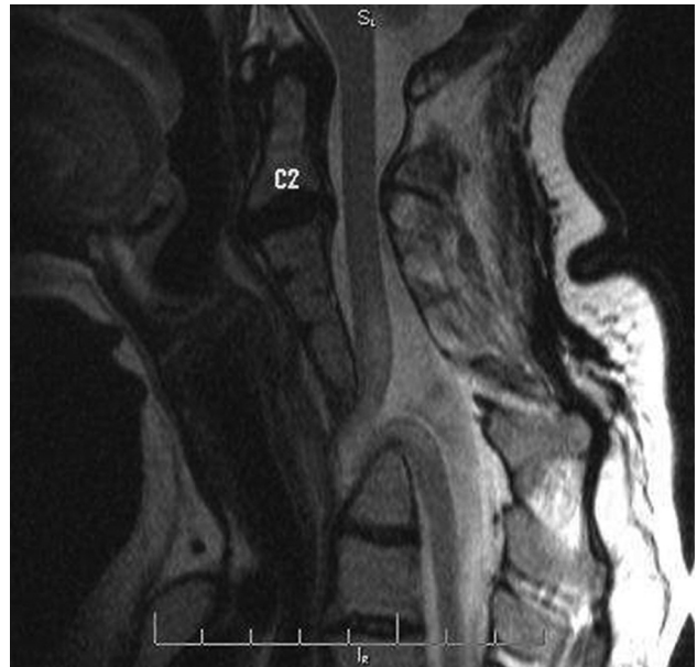
Fig 1. T2-weighted sagittal view of the cervical spine shows fused cervical vertebrae and an anterior meningomyelocele.