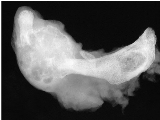
Fig 2. Specimen radiograph demonstrates more clearly the central chondroid matrix of the tumor.

similar to those described for osteoid osteoma, 3 and such resemblance is a particular challenge to the pathologist. 5