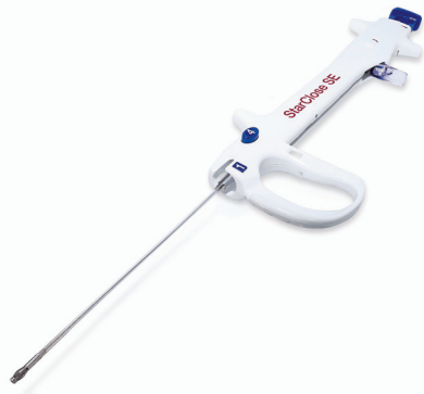
Fig 1. The StarClose SE vascular closure system (6F introducer sheath not shown).

manual compression were to remain flat for 6 hours, after which time they were permitted activity.