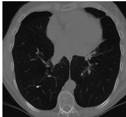
Fig 2. Native chest CT scan demonstrates a cement embolus in a peripheral right lower lobe pulmonary artery.

The frequency of PCE was assessed per patient as a proportion, with 95% CIs. Univariate logistic regression analysis was performed for the following possible risk factors for the occurrence of PCE: age, sex, number of treated vertebrae, cement volume injected per vertebra