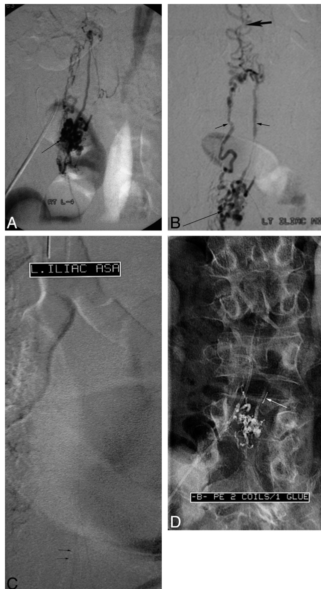
Fig 2. Spinal AVF of the filum terminale (patient 4). A , Selective spinal angiogram of the right L4 radiculomedullary artery shows a vascular nidus ( arrow ) and early draining veins B and C . Selective spinal angiograms of the left lateral sacral artery represent the same nidus ( long arrow in B ), draining veins ( short arrows in B ), and dilated perimedullary vein running upward ( thick arrow in B ) and filling the anterior spinal artery ( arrows in C ) beyond the nidus. D , Postembolization lumbar spine anteroposterior view shows the embolized nidus, draining veins with n -BCA, an a detachable coil ( arrow ) for protection of the anterior spinal artery during embolization.

also complex. There were 2 distinct veins filling from the nidus. The perimedullary veins were eventually filled, causing venous hypertension of the spinal cord.