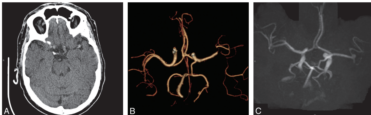
Fig 1. Thrombosis of an intracranial aneurysm and parent artery with early recanalization (case 9). A 63-year-old man had acute aphasia and right hemiparesis (NIHSS score, 21). A , Plain CT scan 2 hours after stroke onset shows a left MCA hyperattenuation, and the presence of a berry aneurysm is suspected on the apparent enlargement of the artery. B , Volume-rendering of CT angiography revealed a left M1-M2 occlusion, and a thrombosed left MCA aneurysm is not detectable. Intravenous thrombolysis was not performed, and after lumbar puncture excluding a meningeal hemorrhage, he was treated with aspirin, 250 mg/day. C , Time-of-flight MR angiography performed the day after shows recanalization of the left MCA aneurysm. He was discharged and sent home on day 8 with persistent aphasia (NIHSS score, 8), and surgical obliteration (clipping) of his aneurysm was performed 6 weeks later (aneurysm anatomy did not allow an intra-arterial procedure).

ing the 8-year study period and 1.4% of the population of patients with symptomatic intracranial aneurysms managed in our hospital. Baseline characteristics, acute management, aneurysm pattern, and patient outcome are presented in Online Tables 1 and 2. All presented with an ischemic stroke distal to a small or large sacciform intracranial aneurysm. Infarctions were located in the MCA territory in 4 and in the posterior circulation in 5. Work-up did not identify atherothrombotic or cardioembolic origin or small vessel disease. Headache or orbital pain or both were noted at presentation in 2 patients and appeared at 24 hours in another. No patient had neck stiffness or meningeal syndrome, and there was no sign of SAH on the initial CT scan or MR imaging. Aneurysms were <25 mm in their greatest diameter, with a mean size of 9.6 \pm 6 mm (range, 3–20 mm).