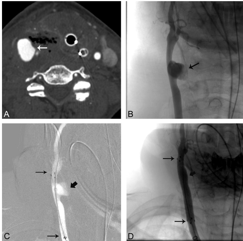
Fig 1. A 51-year-old woman with glottic and hypopharyngeal cancer who presented with hemoptysis (On-line Table). A , Axial contrast-enhanced CT scan of the neck shows extravasation from the RCCA (arrow) with surrounding air. B , AP RCCA angiogram shows the area of extravasation (arrow). C , AP roadmap of the RCCA shows placement of a covered stent (long arrows) across the area of extravasation (short arrow). D , AP RCCA angiogram after covered stent (long arrows) placement shows no evidence of extravasation (short arrow).

similar to those of the initial CBS presentations (On-line Table).