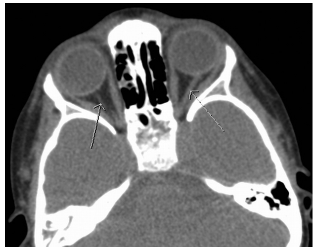
Fig 2. Axial unenhanced CT scan of the orbits at the level of the greater sphenoid wing demonstrates accessory extraocular muscles (arrows) medial to the lateral rectus muscles and lateral to the optic nerves (not shown on this image) that arise from the orbital apex at the annulus of Zinn and insert directly on the posterior globe, with no bridging connection or assimilation into the surrounding muscles.

markedly. The thin sliver of tissue within the contralateral right orbit was not resected because it did not cause any clinical abnormality.