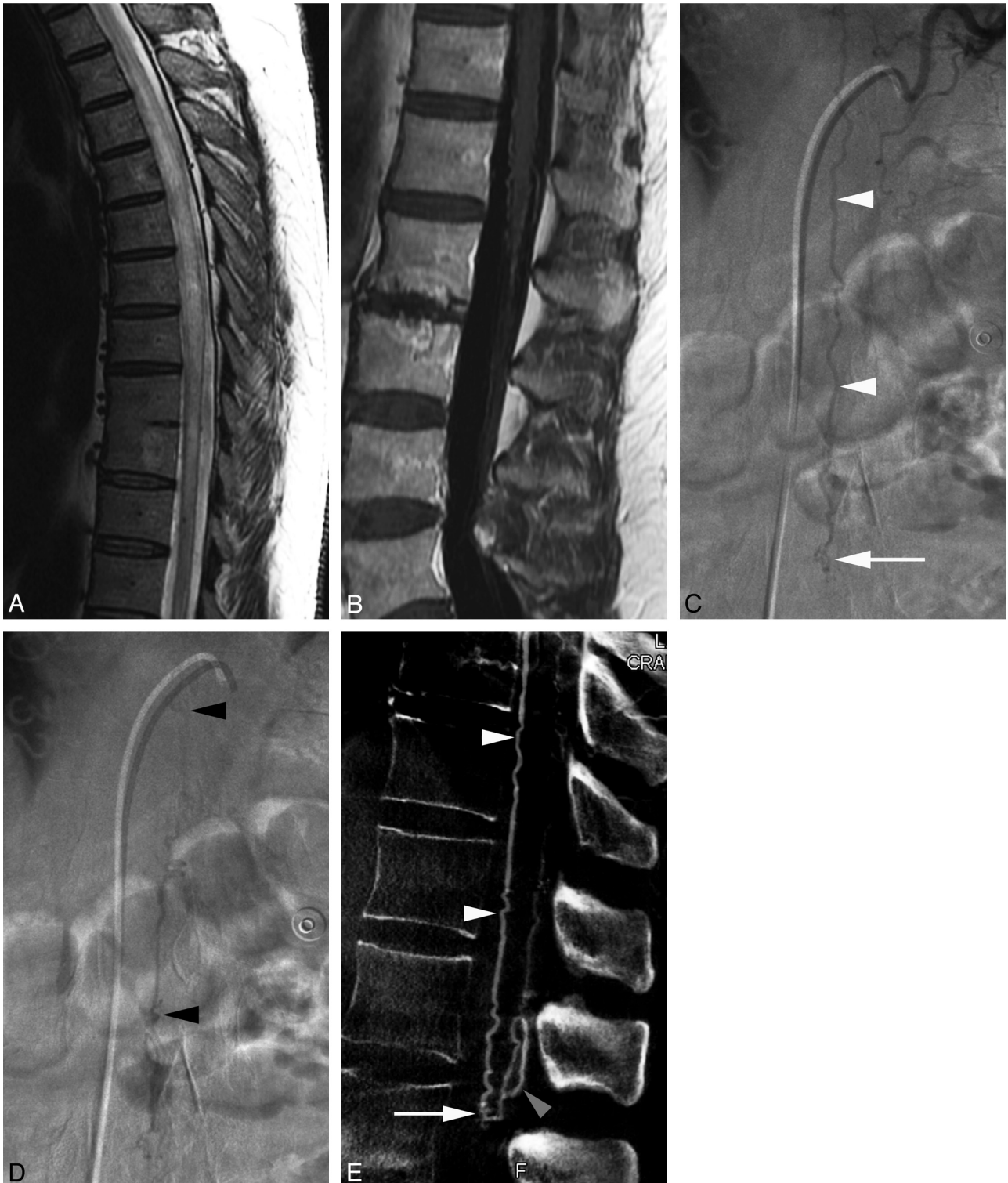
Fig 2. 57-year-old man with a perimedullary arteriovenous fistula of the conus medullaris. A , MR imaging, sagittal T2-weighted image of the thoracic spine, showing diffuse spinal cord swelling and hyperintensity; B , MR imaging, sagittal T1-weighted image after gadolinium administration of the lumbar spine. Note the presence of enhancing venous structures around the conus medullaris and along the filum terminale. C , Spinal DSA, left T10 injection, anteroposterior view, early arterial phase, showing a prominent descending ramus of the anterior spinal artery ( white arrowheads ) reaching the level of the conus medullaris, where a small tangle of blood vessels may be seen ( arrow ). D , Spinal DSA, left T10 injection, anteroposterior view. In the late arterial phase, while the vascular tangle is still visible, extensive opacification of the perimedullary venous system is noted ( black arrowheads ). E , FPCA, left T10 injection, sagittal MIP, voxel size = 0.4, section thickness = 3.0, demonstrating the anterior spinal artery ( white arrowheads ) ending at the tip of the conus medullaris (L1/L2) into a Type I perimedullary arteriovenous fistula ( arrow ). The posterior location of the enlarged draining veins detected by spinal DSA is well documented on this sagittal reconstruction ( gray arrowhead ).

ticular, the exact location of the shunt and abnormal perimedullary veins detected by spinal DSA, later confirmed during surgical treatment (Fig 2E). High-resolution multiplanar re-