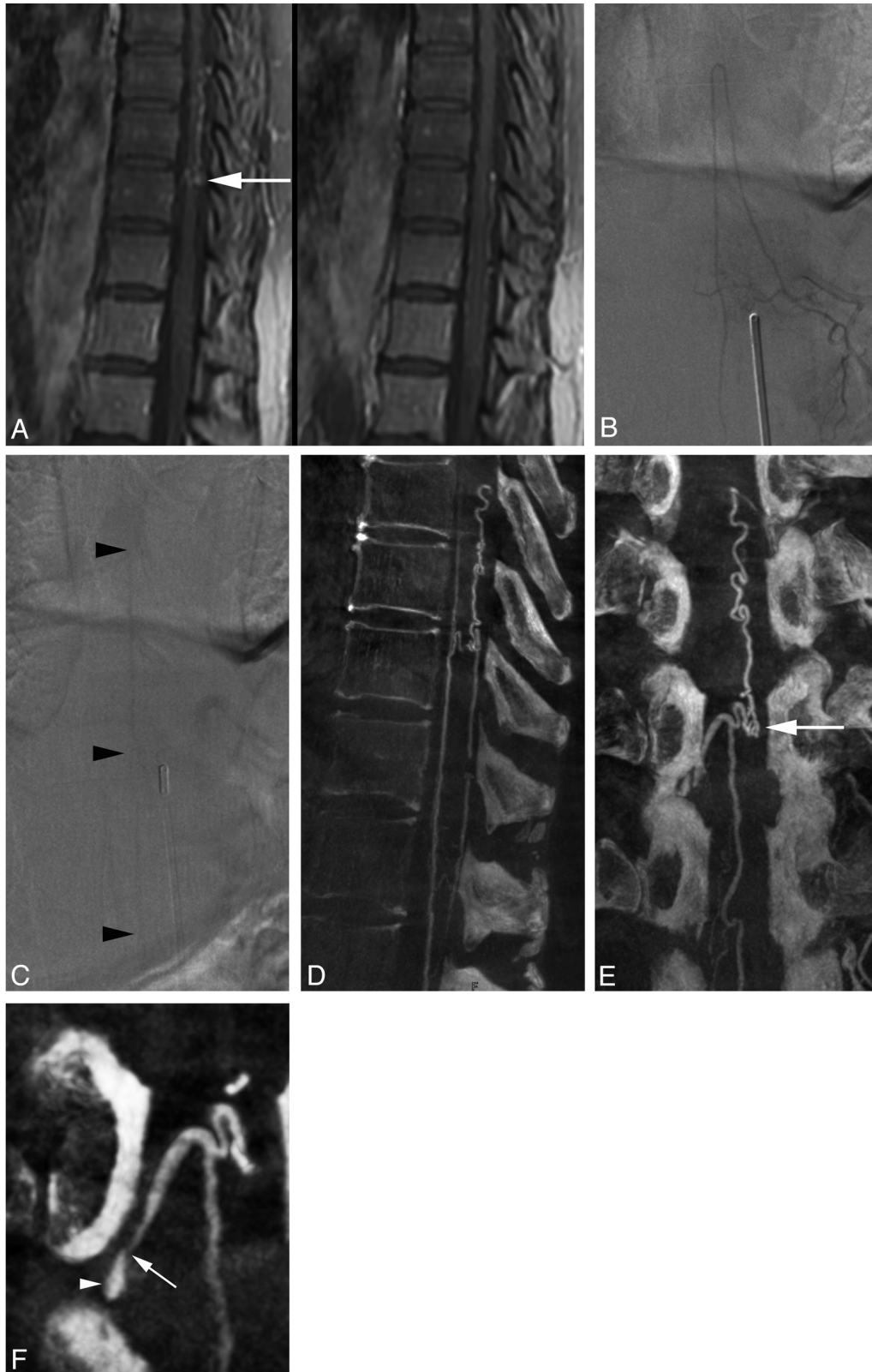
Fig 3. 58-year-old woman with a history of severe midscapular pain. A , MR imaging, sagittal T1-weighted images after gadolinium administration, showing prominent venous structures along the dorsal surface of the spinal cord between T8 and T12. A tangle of veins at the upper aspect of T10 was considered particularly suspicious for a vascular malformation ( arrow ). B , Spinal DSA, left T11 injection, anteroposterior view centered at T10/T11, arterial phase, documenting the artery of the lumbosacral enlargement (artery of Adamkiewicz). C , Spinal DSA, left T11 injection, anteroposterior view centered at T10/T11, venous phase. In this venous phase, the anterior spinal axis can be seen ( arrowheads ), without evidence of enlarged or abnormal veins. D , FPCA, left T11 injection, sagittal MIP, voxel size = 0.4, section thickness = 3.0, demonstrating the thoracolumbar perimedullary venous system, including the dorsal venous structures documented by MR imaging. E , FPCA, left T11 injection, coronal MIP, voxel size = 0.4, section thickness = 2.0. This coronal projection is an enlarged but otherwise unremarkable venous segment ending in a tangle of veins at the upper aspect of T10 ( arrow ), matching the suspicious structure seen by MR imaging ( A , left). F , FPCA, left T10 injection, oblique MIP, voxel size = 0.1, section thickness = 1.0. This high-resolution reconstruction depicts the fine morphology of the right medullary vein exiting the dural sac at T10/T11. Note the narrowing of the vein as it pierces the dura ( arrowhead ) to join the internal vertebral venous plexus (epidural plexus; arrowhead ).