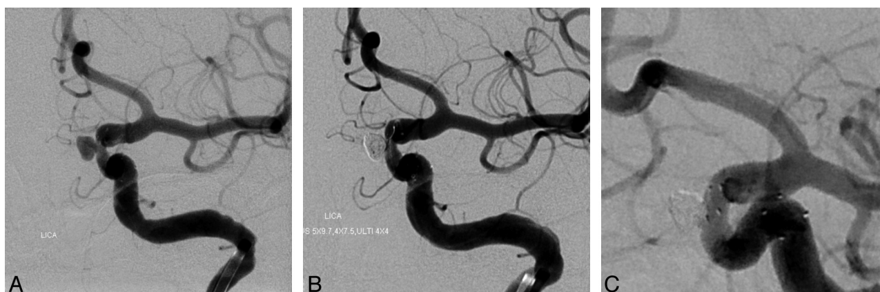
Fig 2. Frontal views of DSA of the left internal carotid artery, showing a 5.5-mm SHA aneurysm pointing medially in a 36-year-old woman (A). The aneurysm was successfully embolized by using a stent-assisted technique (B) and progressed to complete occlusion on the 6-month follow-up angiogram (C).