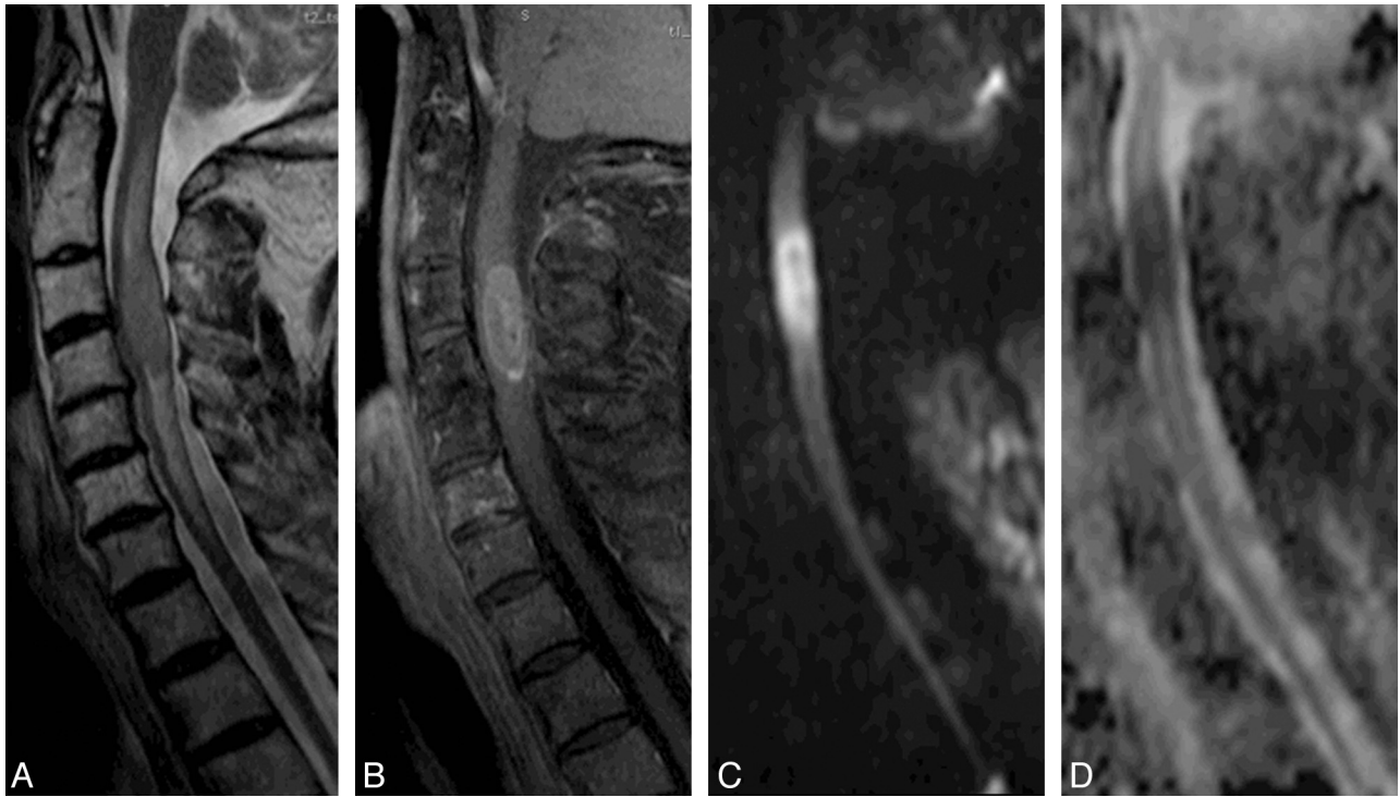
FIG 1. A solid spinal cord expansion lesion is demonstrated in a 79-year-old man with non-Hodgkin lymphoma. Sagittal T2-weighted image (A) shows an expansive hypointense lesion, surrounded by edema, which enhances after the intravenous contrast administration in the sagittal T1-weighted image (B). The lesion also has restricted diffusion on DWI (C), confirmed on the ADC map (D).