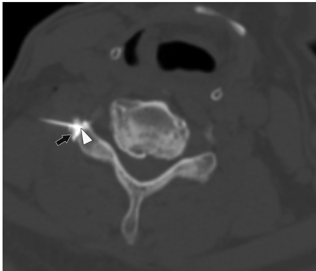
FIG 2. A 59-year-old man with right-neck pain radiating to the hand who had a CT-guided CTSI of the right C6 nerve root. The needle angle is 46°, and the tip of the needle is in the extraforaminal location (arrowhead) abutting the facet. The contrast is seen in the extraforaminal region (black arrow).

the contrast distribution. The needle-tip location was categorized as foraminal zone, junctional, and extraforaminal. These anatomic divisions are shown on Fig 1. Foraminal zone and extraforaminal locations were separated by an oblique line from the anterolateral vertebral body to the lateral margin of the facet. When the needle tip was on the oblique line (outer margin of the neural foramen), it was considered to be a junctional location. The needle angle was measured relative to the longitudinal axis of the neural foramen (Fig 1).