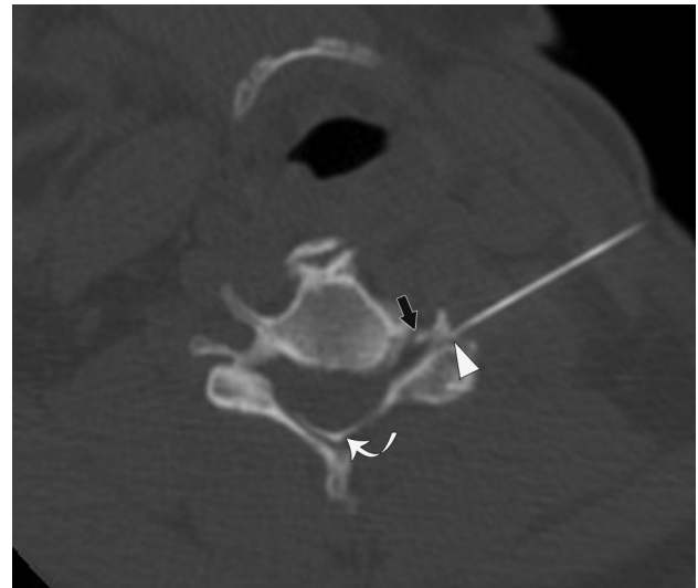
FIG 3. A 51-year-old woman with left-neck pain radiating to the forearm who had a CT-guided CTSI of the left C5 nerve root. The needle angle is 28°, and the tip of the needle is in the junctional location (arrowhead). Contrast is seen in the extraforaminal and intraforaminal (black arrow) regions. Contrast is also present in the central epidural space (curved arrow).

The distribution of contrast material generally lay in both the intraforaminal and extraforaminal locations. However, in 5 cases, there was an isolated intraforaminal distribution (Fig 1), and in 16 cases, there was an isolated extraforaminal distribution (Fig 2).