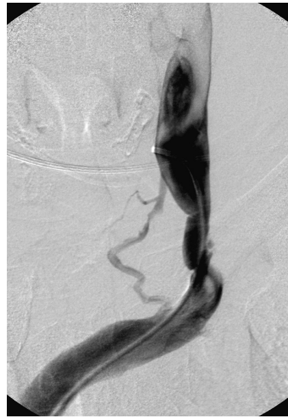
FIG 4. Anteroposterior venogram of the left IJV in a 50-year-old woman without MS being investigated for hyperparathyroidism. The moderate-sized collateral to the left brachycephalic vein is remarkably similar to that in Zamboni et al (Fig 4C). 12

similar to the rate of IJV narrowing of \geq 50\% in our small series of 8/9 patients (88.9%) without MS.