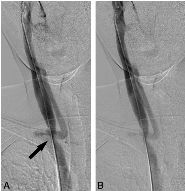
FIG 2. Selective anteroposterior venography of the right IJV demonstrates a high-grade narrowing of the distal IJV ( black arrow ) with an associated large collateral vein. This patient is a 44-year-old woman without MS who was being investigated for hyperparathyroidism. These appearances are remarkably similar to those in Zamboni et al (Fig 5) 12 ; Zamboni et al (Fig 2Bg) 9 ; and Simka et al (Fig 3) 40 .

diagnosis of chronic cerebrospinal venous insufficiency should, therefore, rest with venography.