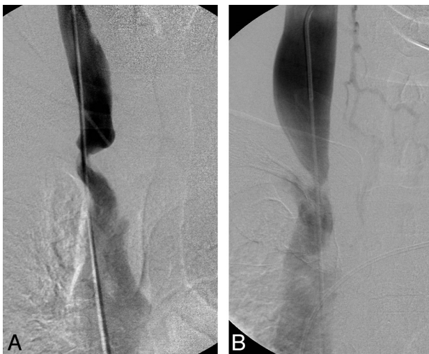
FIG 3. Selective anteroposterior venography of the right IJV. A, A 60-year-old female patient without MS being investigated for hyperparathyroidism. B, A 51-year-old man without MS being investigated for Cushing disease with petrosal sinus sampling. Both images demonstrate very high-grade narrowing of the distal IJV. Figure 3A is remarkably similar to Fig 2 in Ludyga et al, 45 and 3B is very similar to Fig 2B (e and f) from Zamboni et al, 9 Fig 2 from Simka et al 40 and Fig 4A from Zamboni et al. 12

Simka et al 40 published a large series on venography in 586 patients with MS demonstrating venous abnormalities in 64% of the right IJVs and 81.7% of the left IJVs. Stenosis of the IJV was demonstrated unilaterally or bilaterally in 59 of 65 patients with MS (91%) in the study of Zamboni et al, 12 which is remarkably