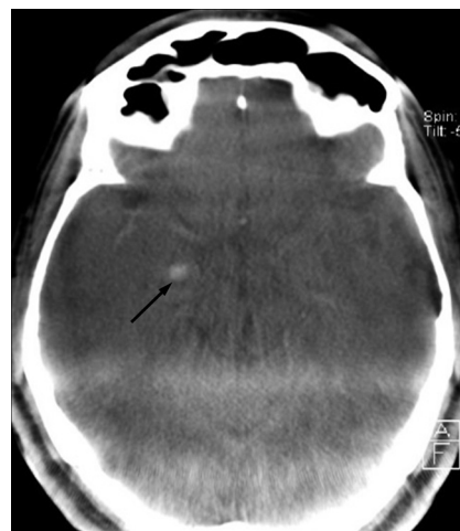
FIG 2. Flat panel CT immediately after stent-assisted recanalization of a carotid bifurcation occlusion with intravenous thrombolytic bridging therapy in a 72-year-old male patient (admission modified Rankin Scale score, 4; stroke time to admission, >3 hours; recanalization-to-follow-up CCT, 14.7 hours). Focal hyperattenuation (arrow) of the right hippocampus is believed to be due to contrast enhancement attributable to disruption of the blood-brain barrier.

Flat panel CT images were assessed for the presence of subarachnoid hemorrhage, intracerebral bleeding (ICB), and BBB disruption by 2 readers (T.K., with 9 years of experience in radiology, Austrian board-certified radiologist, European board-certified neuroradiologist; M.H., with 7 years of experience in radiology, Austrian board-certified radiologist) separately, followed by consensus reading. Both readers were aware of which vessel had been occluded initially; however, they were blinded to further clinical data and conventional CT results. Pathologic intracerebral hyperattenuations were considered the result of BBB disruption if the borders of anatomic structures or vascular territories