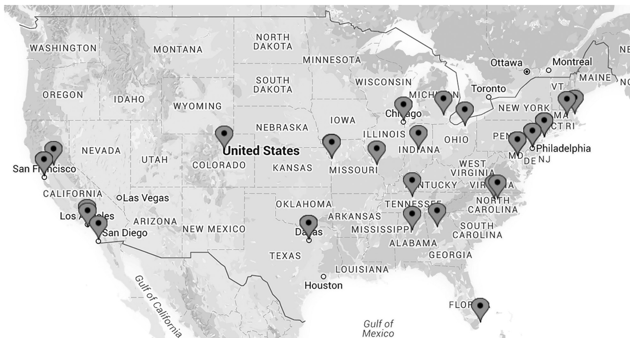
FIGURE. Locations of stroke centers responding to the survey.

tices by conducting a nationwide survey of practices in effect at experienced stroke centers, identify highly consistent workflow steps that may indicate general agreement on best practices in real-world conditions, and recognize areas of greater workflow variability that may suggest that such a consensus has yet to emerge.