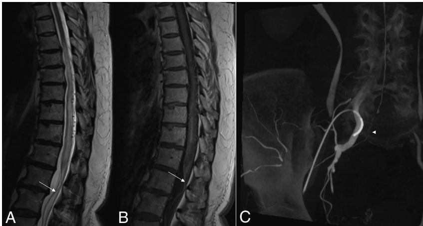
FIG 1. A 63-year-old woman with a sacral dural arteriovenous fistula at S1. A , Sagittal T2-weighted MR imaging shows a dilated vein of the filum terminale ( white arrow ). B , Contrast-enhanced T1-weighted MR imaging again demonstrates the dilated vein of the filum terminale ( white arrow ). C , Rotational digital subtraction angiogram reformatted in the coronal plane following injection into the right internal iliac artery demonstrates a fistula at S1 ( arrowhead ), with a dilated vein of the filum terminale.

nal dural AVF such as the location of cord edema or the epicenter of the dilated perimedullary vessels cannot provide information about the location of the fistula, 2 there have recently been a few case reports and smaller case series suggesting an association between a dilated vein of the filum terminale (VFT) and a deep lumbar or sacral AVF. 12,13 We thus performed a retrospective review of SDAVFs and SEDAVFs from 2 tertiary referral centers to test the hypothesis that a dilated VFT, identified as a curvilinear midline flow void on T2WI or a dilated contrast-enhancing vessel below the conus on T1-weighted postcontrast images, is an imaging marker for a lower lumbar (L3–L5) or sacral fistula.