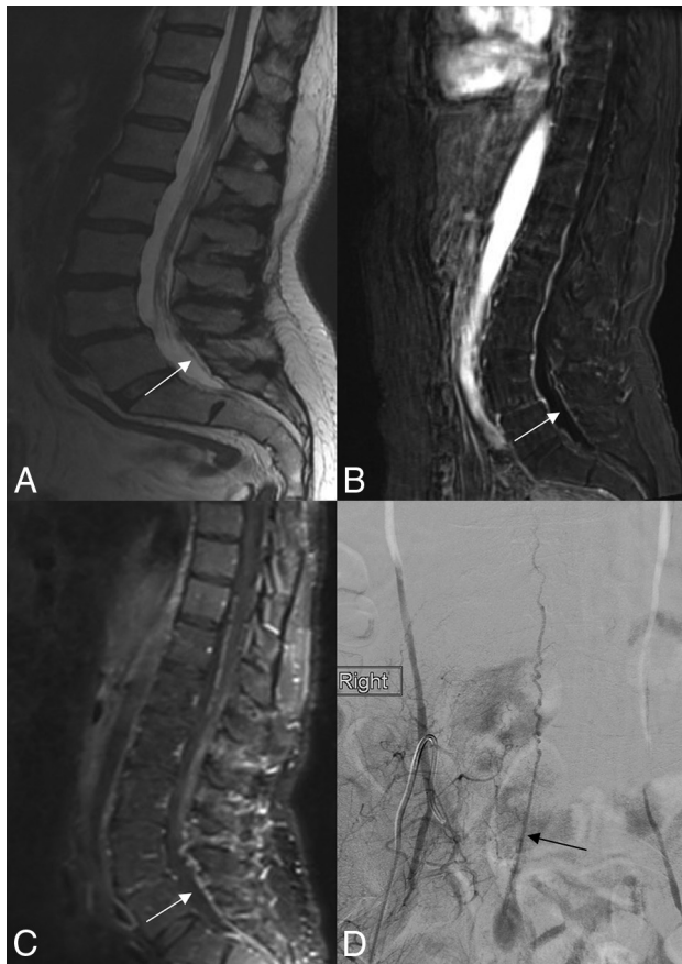
FIG 2. A 75-year-old man with a sacral dural arteriovenous fistula at S1. A, Sagittal T2-weighted MR imaging shows a dilated vein of the filum terminale (white arrow). B and C, Contrast-enhanced MRIs demonstrate marked dilation of the vein of the filum terminale (white arrow). D, Conventional angiogram in the anteroposterior plane following injection into the right internal iliac artery demonstrates a fistula at S1 with a dilated vein of the filum terminale (black arrow).

sagittal T2-weighted MR imaging. The presence of such a vein prompted the investigators to pursue pelvic angiography before thoracolumbar angiography, resulting in prompt identification of the fistulous point. 12 In a more recent series of sacral fistulas by Gioppo et al, 16 the authors found that all 15 sacral fistulas had an enlarged VFT on MR imaging. Meanwhile, a recently published series of spinal vascular malformations at the L5 level or below found that 60% of fistulas had a dilated filum terminale vein, further reinforcing the association between a dilated VFT and the presence of a deep lumbar or sacral fistula. 13 Our study differs from these prior studies because we are able to confirm that a dilated VFT identified using conventional