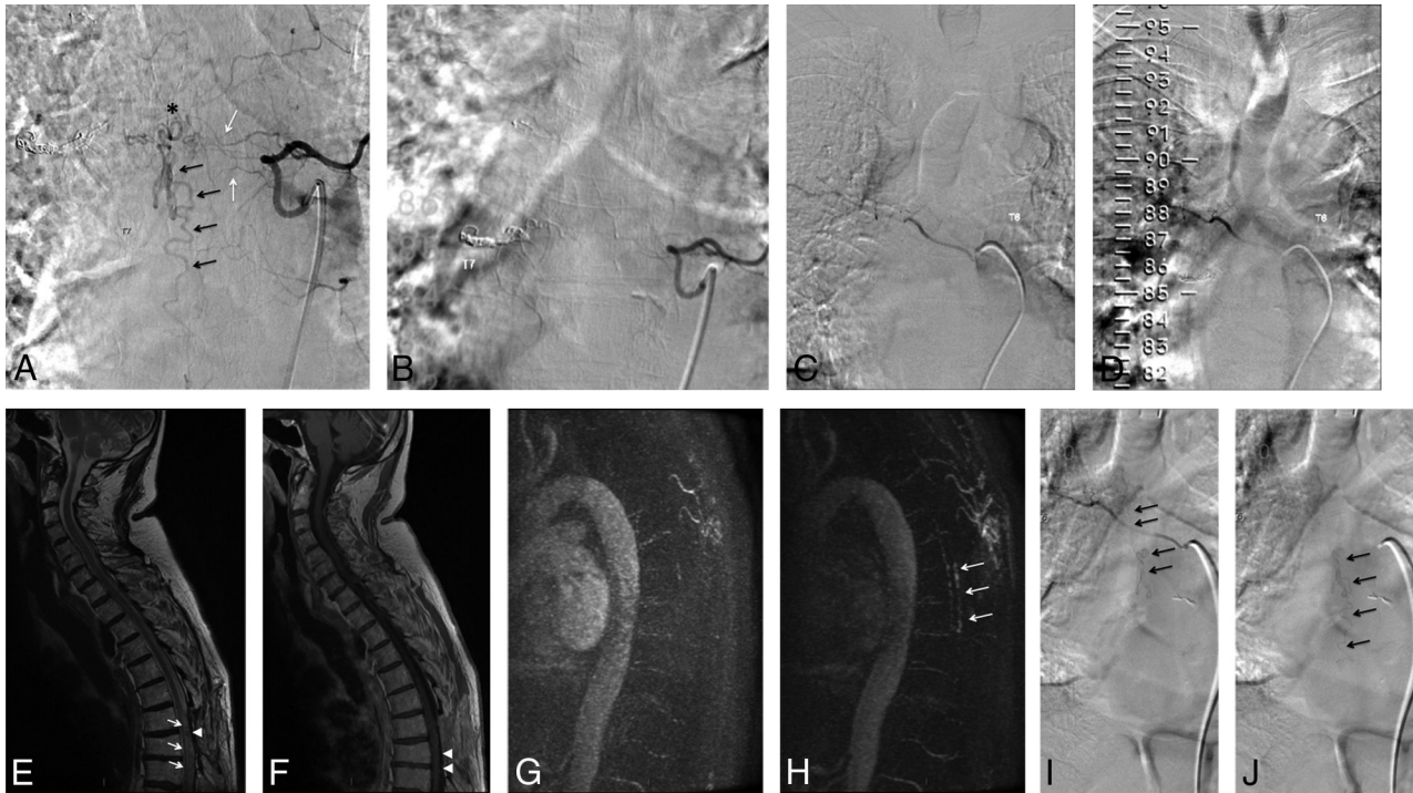
FIG 2. A 76-year-old man who had a previous embolization with coils and Onyx (Covidien, Irvine, California) for a right T7 SDAVF. Recurrence of the clinical symptoms (gait disturbance) was observed >1 year after the endovascular treatment. The spinal cord MR imaging (not shown) was suggestive of a recurrence of the fistula. An sDSA was performed (A) and confirmed the recurrence of the fistula ( asterisk indicates the shunt point; black arrows , descending venous drainage), which was fed by the contralateral intercostal artery (left T7) via the retrocorporeal network (A, white arrows ). The patient was referred for surgery for the treatment of this recurrence. After surgical treatment, the patient experienced a slight clinical worsening (ataxia). Within the 2 months after the surgical treatment, the patient continued to experience gradual clinical worsening (worsening of the ataxia with walking being impossible). A full sDSA was scheduled to rule out a recurrence of the SDAVF. The selective injection of the left T7 intercostal artery showed no residual fistula (B). The right T6 intercostal artery could not be catheterized selectively due to ostium stenosis, and the injection was performed in front of the origin of the intercostal artery (C, early phase; D, late phase). The sDSA findings were thus interpreted as normal. A spinal cord MR imaging was performed the day after the sDSA (E, sagittal T2WI; F, sagittal contrast-enhanced T1WI) and showed postoperative changes associated with spinal cord hyperintensity, suggestive of venous edema (E, white arrows ). Equivocal posterior perimedullary serpiginous T2 hypointensities (E, arrowhead ) presenting a doubtful enhancement were also seen (F, arrowheads ), possibly corresponding to perimedullary vein dilations. Time-resolved MR angiography (Time Resolved Imaging of Contrast Kinetics, TRICKS; GE Healthcare, Milwaukee, Wisconsin), sagittal acquisition (G, early phase; H, late phase). Abnormal early perimedullary vein enhancement was seen (H, white arrows ) at the midthoracic level, suggestive of sAVF recurrence (On-line Video). A new sDSA was performed with the patient under general anesthesia. Selective catheterization of the right T6 intercostal artery (I, early phase; J, late phase) confirmed the recurrence of the spinal DAVF with early opacification of dilated perimedullary veins (I and J, black arrows ).