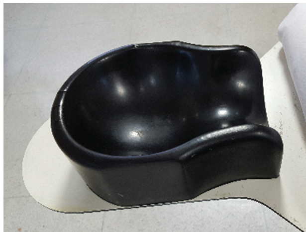
FIG 1. Rigid and radiolucent head holder.

Before each intervention, a Foley catheter and 2 intravenous lines were inserted in each patient in the intensive care unit. For a further reduction of head motion during the intervention, a custom-made, rigid, radiolucent headholder attached to the angiography table was used (Fig. 1). Electrocardiography, blood pressure cuffs, and pulse oximetry were applied throughout the procedure to monitor the patients. For real-time clinical assessment, frequent neurologic examinations (motor, sensory, and speech) were performed. In all procedures performed with the patient under local anesthesia, conscious sedation, or deep sedation, to