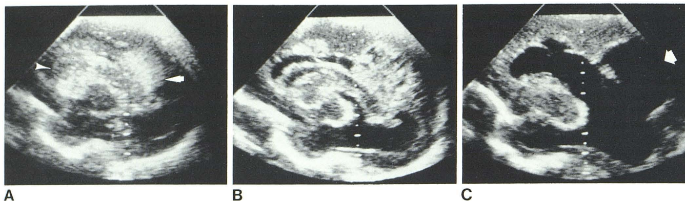
Fig. 2.—Development of porencephaly after IPH. A , Day 6. Sagittal sonogram. Left IVH (arrowhead) and IPH (arrow). B , Day 14. Severe dilatation with clot retraction and initial changes of IPH to porencephaly. C , Day 28. Porencephaly (arrow) in parietooccipital area with persistent severe dilatation.