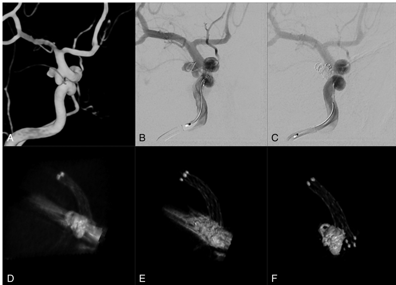
FIG 3. Neuroform EZ stent-assisted embolization of a ruptured aneurysm in the right posterior communicating artery. A and B, DSA and 3D reconstructed images show a right posterior communicating wide-neck aneurysm with an irregular petal shape (tumor neck: 3.4 mm; 2 daughter sacs of 2.8 × 3.6 and 2.4 × 3.1 mm). C, Complete aneurysm embolization with the Neuroform EZ stent (3.5 × 30 mm) while maintaining artery patency. D, Normal DynaCT reconstructed images immediately after the operation show that the stent mark is clearly developed, the stent wire is poorly developed, and the coil metal artifacts are large. E, DynaCT Micro reconstructed images immediately after the operation show that the mark at the 2 ends of the stent is well developed, the stent wire is significantly well developed (relative to normal DynaCT), and the coil metal artifacts are still large; F, Reconstructed images of DynaCT Micro combined with SMART immediately after the operation show that the marks of the stent and the nickel-titanium wire are well developed, the metal artifacts of the stent wire and coils are significantly reduced, and the overall image quality is significantly improved.