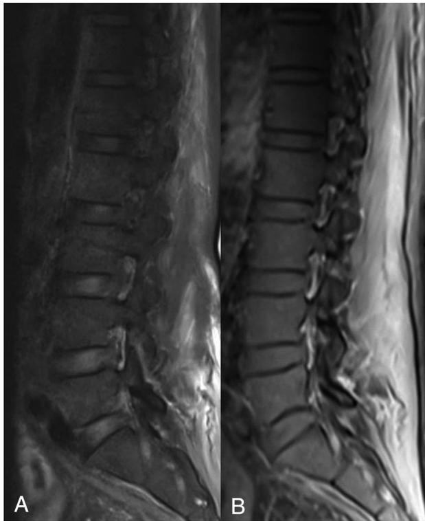
FIG 1. A 56-year-old man with COVID-19. A , sagittal fat-saturated T2-weighted image of the lumbar spine demonstrating increased T2 signal intensity within the posterior paraspinal muscles. B , post-contrast fat-saturated T1-weighted image of the lumbar spine demonstrating diffuse enhancement within the posterior paraspinal muscles.

recorded in reference to the vertebral body level for each patient. Indications for spine MR imaging included a report of back pain in 5 patients, bilateral leg pain in 2 patients, imbalance in 1 patient, and 1 patient who was found unconscious after a suicide attempt.