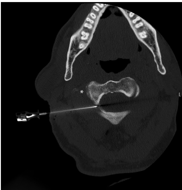
FIG 2. Intraprocedural axial CT image (patient 10) showing placement of a 22-ga RFA cannula at the expected location of the C2 DRG. The needle tip lies just above the C2 pedicle. The vertebral artery is safely located lateral to the C2 vertebral body at this level (asterisk).

is then performed using a 1:1 mixture of 1 mL preservative-free dexamethasone, 10 mg/mL, and 0.5% bupivacaine; the needle is removed and sterile dressing applied. Patients are observed for 1 hour and discharged home.