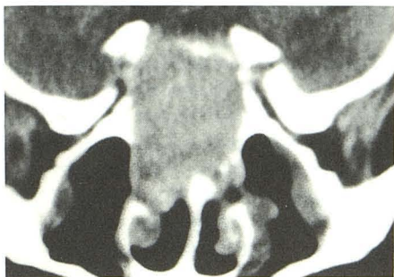
Fig. 3.—Patient 3. Coronal postcontrast CT scan shows enhancing destructive lesion of central skull base, sphenoid sinus, and posterior nasal vault. This is a representative scan of the cases of central skull-base metastasis. The enhancement can be appreciated by comparison to the attenuation of the brain.