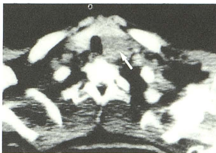
Fig. 4.—Patient 1. Axial noncontrast CT scan shows left thyroid lobe and a portion of the isthmus to be enlarged (arrow) with decreased attenuation compared with normal-appearing right thyroid lobe. There is no invasion of the trachea, and surrounding tissue planes are well maintained.