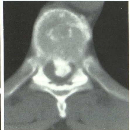
Fig. 4.—Large calcified herniated disk fragment protrudes 11 mm into spinal canal. Anterior disk space calcification depicts site of origination of protruded disk fragment. This patient had no neurologic symptoms.