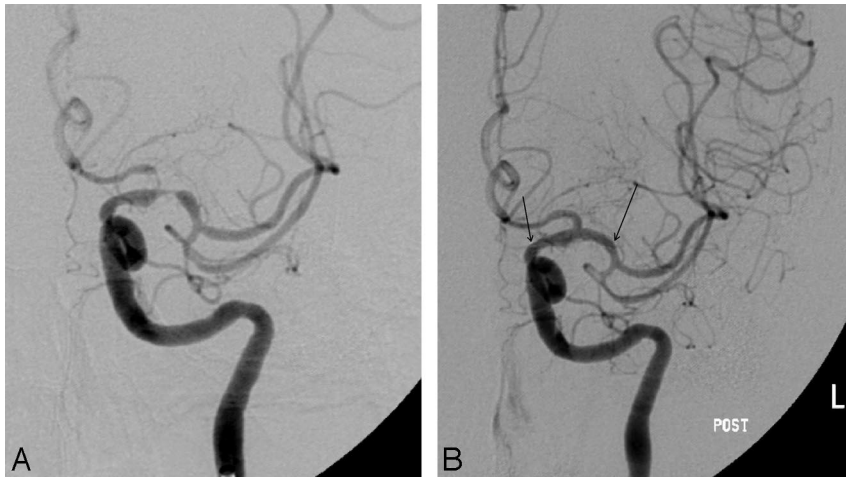
Fig 1. A, Left internal carotid artery cerebral angiography demonstrates severe stenoses of the ACA and MCA, which are confluent at the carotid terminus. B, After angioplasty alone of the ACA and stent-assisted angioplasty of the MCA, there is normal caliber of the previously stenosed ACA and MCA. Arrows denote the proximal and distal ends of the stent.