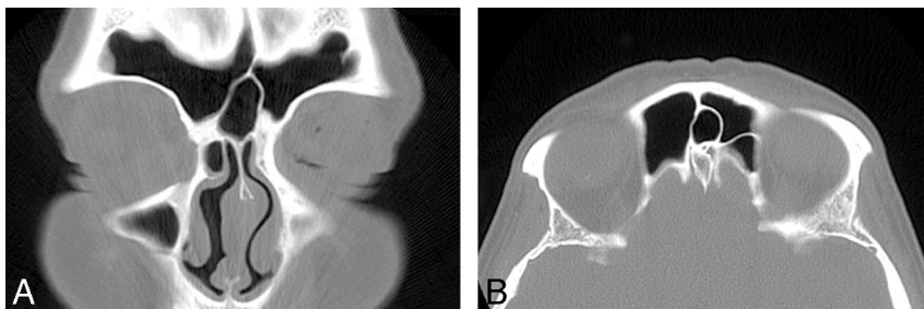
Fig 4. Coronal (A) and axial (B) noncontrast CT scans of the paranasal sinuses show an air cell within the intersinus septum. On both the coronal and axial images, no communication with either frontal sinus was seen. This is a true septal cell.

recess, which represent rudimentary anterior ethmoid cells. Each pit has the potential to form the frontal sinus; hence the variability in the outflow tract of the frontal sinus. Occasionally, the frontal sinus may develop from an ethmoid cell migrating from the ethmoid infundibulum rather than from the frontal recess, and combined patterns of development may result in multiple sinuses on each side. 7,8