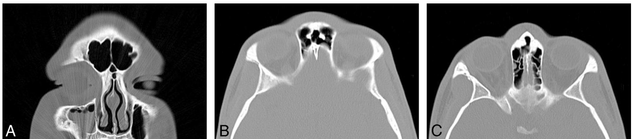
Fig 3. Coronal (A) and serial axial (B, C) noncontrast CT scans of the paranasal sinuses show 2 air cells within the intersinus septum. On the coronal image, the cells seem to arise within the septum. However, on the axial images, 1 cell is a diverticulum from the left frontal sinus (B), and the other cell is a diverticulum from the right frontal sinus (C).