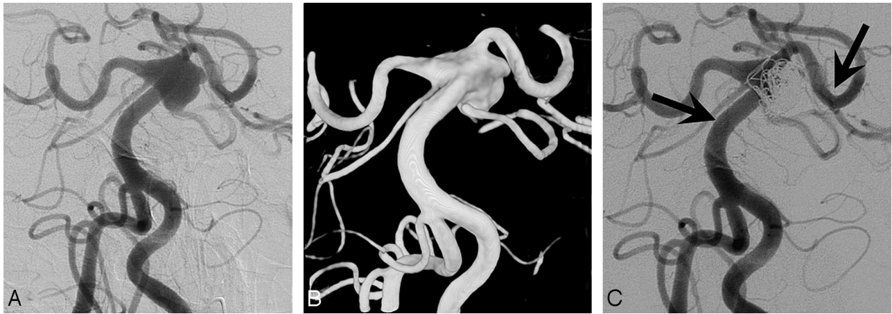
Fig 2. A 58-year-old woman with a ruptured superior cerebellar artery aneurysm without a neck. A and B , 2D and 3D vertebral angiograms demonstrate the dysplastic distal basilar segment with a large superior cerebellar artery aneurysm. The superior cerebellar artery arises from base of the aneurysmal sack, and the dysplastic segment extends to the proximal posterior cerebral arteries. C , Result after stent-assisted coiling. Proximal and distal stent markers are indicated by arrows. Flow in the superior cerebellar artery is preserved.