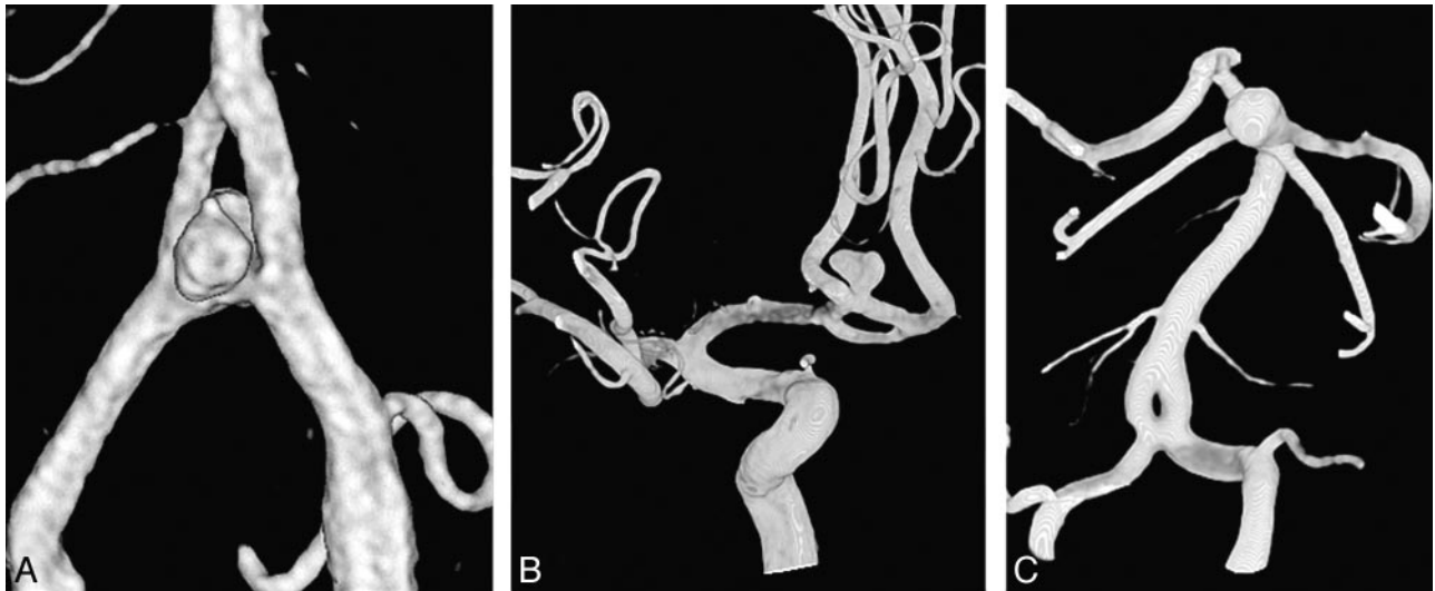
Fig 1. Classification of the relation of the location of the fenestration with the location of the aneurysm. A , Aneurysm is located on the fenestration in a patient with a vertebrobasilar junction aneurysm and a proximal basilar fenestration. B , Aneurysm is located adjacent to (but not on) a fenestration in a patient with an AcomA aneurysm and a fenestration of the AcomA. C , Aneurysm is located remote from a fenestration in a patient with a basilar tip aneurysm and a proximal basilar fenestration.

In patients with both aneurysms and fenestrations, we classified the relation of the location of the fenestration with the location of the aneurysms as remote from the fenestration, adjacent but unrelated to the fenestration, or on the fenestration itself (Fig 1). In addition, we assessed whether detected fenestrations were visible in retrospect on standard projections of 2D angiographic images.