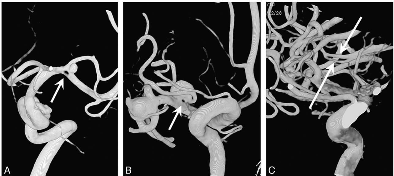
Fig 4. Examples of middle cerebral artery fenestrations (arrows). A , Fenestration at the bifurcation with an associated aneurysm. B , Small fenestration at the neck of an aneurysm in a patient with 2 middle cerebral artery aneurysms. C , A 10-mm segment fenestration in a distal middle cerebral artery (M3).

The anatomic relationship of the 56 fenestrations and the aneurysms in 54 patients with aneurysms was as follows: aneurysm located on the fenestration itself in 10 (18%), aneurysm adjacent to the fenestration in 12 (21%), and aneurysm remote from the fenestration in 34 (68%). In 208 patients with 218 aneurysms, 10 aneurysms (4.5%) were located on a fenestration and 210 were not. Of 61 fenestrations, 51 (84%) were not associated with an aneurysm.