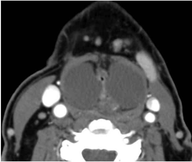
Fig 1. Postoperative laryngoceles. Preprocedural contrast-enhanced axial CT scan demonstrates bilateral internal laryngoceles compressing the glottic airway down to approximately 1 mm.