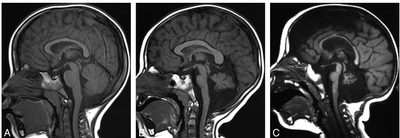
Fig 2. Comparison of sagittal images. A, T1-weighted sagittal image of a 28-month-old control girl. B, T1-weighted sagittal image of a 24-month-old girl with CASK mutations. Note the hypoplastic pons, midbrain tegmentum, and cerebellar vermis with normal appearance of the corpus callosum. C, Sagittal T1-weighted image of a 16-month-old patient with PEHO syndrome shows hypoplasia of all visible structures.