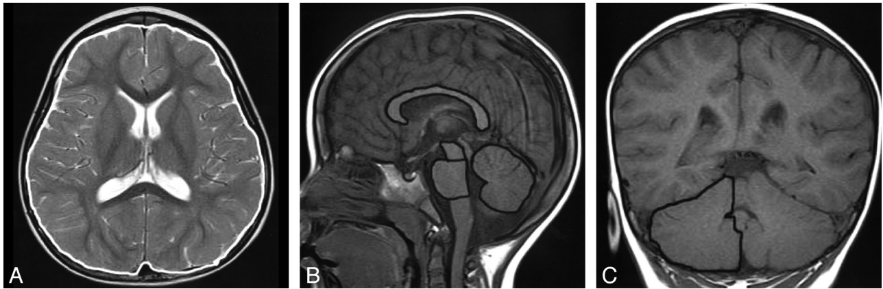
Fig 1. MR imaging of a 3-year-old girl with febrile seizures showing (outlined in white) areas for the cerebrum on a transverse image (A); corpus callosum, pons, midbrain tegmentum, and cerebellar vermis on the sagittal image (B); and the right cerebellar hemisphere on the coronal image (C).

after institutional review board approval was obtained from Tokyo Medical and Dental University and Kameda Medical Center.