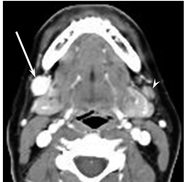
Fig 1. Contrast-enhanced axial CT image from a PET/CT examination demonstrating ENB metastasis (arrow) in a right zone II lymph node. The metastatic lymph node demonstrates maximal contrast enhancement, similar in attenuation to arteries. A normal contralateral lymph node is indicated (arrowhead) for comparison.

On CT, metastatic lymph nodes were predominantly to completely solid in appearance (Table 3). In only 1 patient was a predominantly cystic metastatic node seen on CT. Addition-