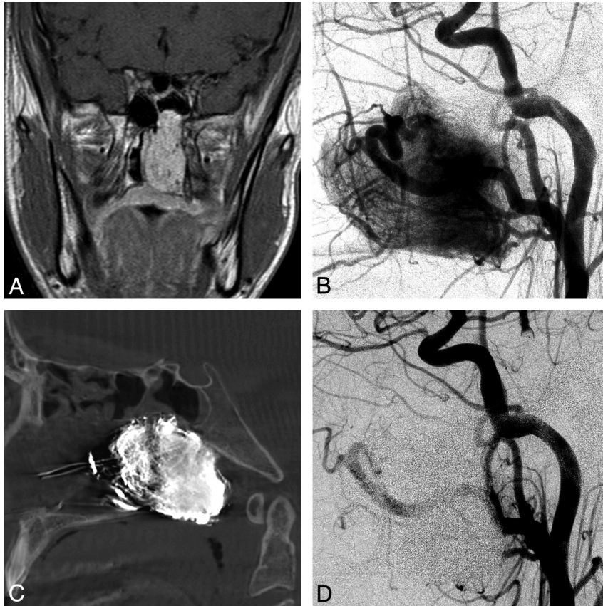
Fig 2. A 13-year-old boy with nasal stuffiness and a Fisch Ib juvenile angiofibroma. A , Coronal contrast-enhanced T1-weighted MR image shows a contrast-enhancing mass within the left nasal cavity and posterior nasopharynx, extending into the left sphenoid sinus. B , Lateral left common carotid angiogram (LCCA) shows the hypervascular mass with supply off the ECA and ICA branches. C , Lateral DynaCT (Siemens, Erlangen, Germany) image shows the EVOH (Onyx) cast within the tumor. D , Lateral LCCA postembolization shows no filling of the hypervascular mass.

feeders, vessel tortuosity, and/or vasospasm may limit this technique. Given these limitations of particulate embolization, direct percutaneous embolization of the tumor with EVOH may offer several advantages.