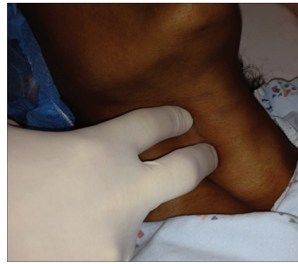
FIG 3. Demonstration of the technique of digital palpation of the neck and manual displacement of critical structures such as the common carotid artery. The right side is generally preferred because the esophagus usually descends left of midline.

Given the estimated size and ventral location of the CSF collection, it was decided to attempt an anterior EBP approach. The patient was placed supine on the fluoroscopy table. Following sterile anterior neck preparation and conscious sedation with vital sign monitoring, the C5-C6 disk space was identified by using frontal fluoroscopy. Local anesthesia was provided with 1% lido-