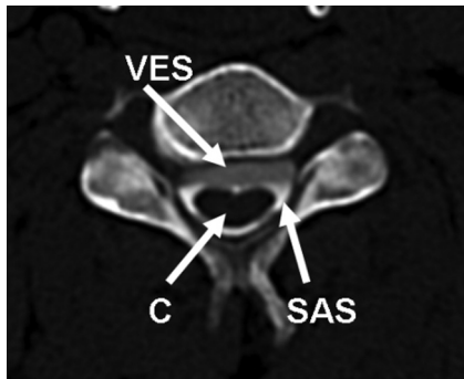
FIG 2. Axial postmyelogram CT through the cervical spine demonstrating ventral epidural contrast collection. SAS indicates subarachnoid space.

the epidural collection were seen in the lower cervical region, suggesting that the site of leakage was in the cervical spine. Radio-nuclide CSF study by using indium-111 diethylene triamine pentaacetic acid was subsequently ordered to further localize the site of leakage but revealed no CSF leak. Neurosurgery was consulted, but given the large size of the fluid collection and unknown exact location of dural injury, it was thought that exploring the ventral spinal column would require a morbid surgery and extensive vertebrectomies. A consultation for possible EBP subsequently occurred.