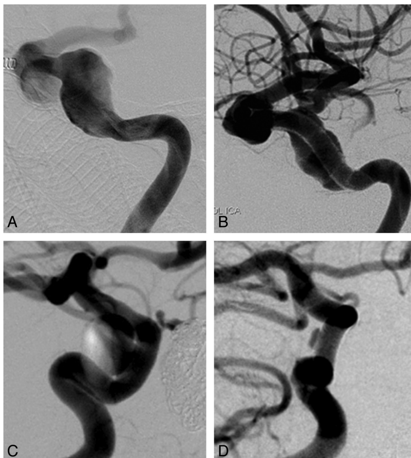
FIG 1. Examples of the absolute agreement among 5 readers. Fusiform aneurysm of the left ICA before (A) and after (B) the procedure, which was assessed unanimously as “incomplete” occlusion and paraclinoid aneurysm (C and D) also assessed unanimously as “near-complete” occlusion.

Independent of the others' assessment, each reader made his