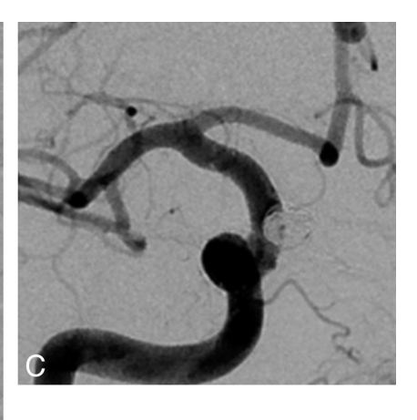
FIG 1. Frontal views of DSA. A , Unruptured wide-neck superior hypophyseal artery aneurysm before treatment. B , Angiogram obtained immediately after SAC with residual filling of the aneurysm. C , Twelve-month follow-up angiogram shows progression of the aneurysm to complete occlusion.