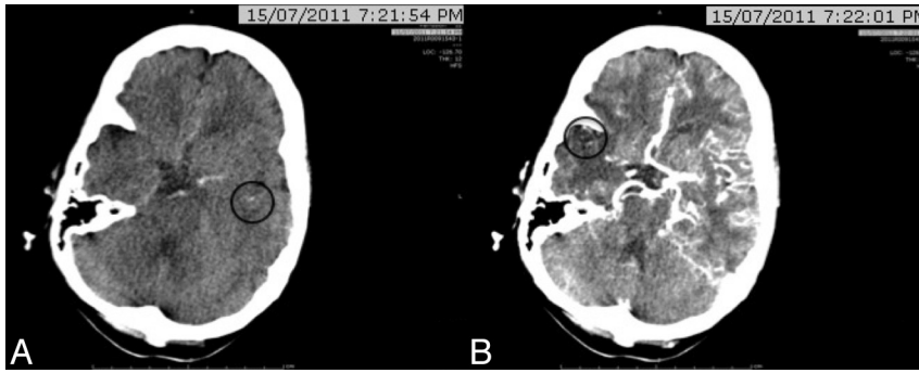
FIG 1. A 67-year-old woman with left hemiparesis and dysarthria who presented to the hospital 2 hours after onset. CTA identified a right intracranial ICA occlusion. CTP-SI showed that the contrast (black circles) was first detected at 20 seconds in the left Sylvian fissure (A) and at 27 seconds in the affected right hemisphere (B). The relative filling time delay was, therefore, 7 seconds.