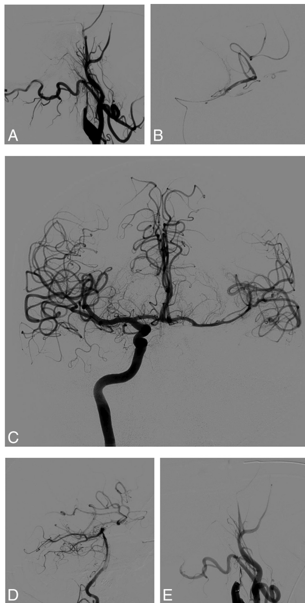
FIG 1. This patient presented with severe right hemiplegia and aphasia (NIHSS score = 20). Initial MR imaging revealed a DWI-ASPECTS = 6 after 4.5 hours since symptom onset, associated with left tandem ICA and middle cerebral artery occlusions. The initial angiogram (A) demonstrates left internal carotid occlusion related to cervical dissection. We then carefully navigated the microcatheter through the dissected ICA to the intracranial occlusion (B). Thrombectomy performed after contralateral femoral puncture and right ICA run shows a functional circle of Willis and no residual left M1 occlusion (C). The posterior communicating artery is also permeable as seen on the left vertebral artery run (D). Consequently, we decided not to treat the cervical ICA dissection, and the artery was left in its initial condition (E).

The initial NIHSS and the Glasgow Coma Scale scores were assessed by a neurologist. MR imaging protocol consisted of diffu-