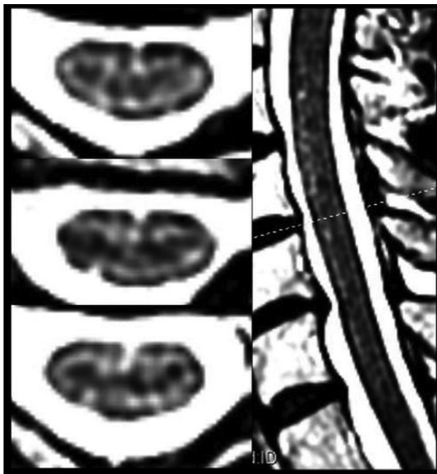
FIG 1. Three consecutive axial FSE-T2 images ( left ) and a 3-mm midline sagittal image ( right ). Left , The upper image demonstrates a conspicuous HIF (asymmetrically located to the left) with no AMF. An anterior “dimple” indentation of the cord is typical at the anterior aspect of the AMF but is not considered an AMF unless accompanied by the sagittal cleft as in the lower image. Middle left , An adjacent section demonstrates an HIF continuous with the base of a faint AMF. Lower left , Adjacent section demonstrates an asymmetric, wider, more conspicuous AMF without a definite HIF. Right , FSE-T2WI midline anterior (ventral) sagittal line (SL-MR imaging) is thin and incomplete and of variable length in the anterior 30% of the cord. Small focal hyperintensities also extend along its course, contributing to variable SL thickness, continuity, and irregularity.

contribute to the craniocaudal lines on sagittal FSE-T2WI (sagittal line [SL]). Characterizing the presence and features of the HIF and AMF might contribute to defining their relationships not only to one another but also to lines, channels, or canals identified on midline sagittal images in other disease states, such as Chiari malformation. 7