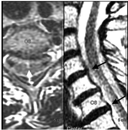
FIG 3. Left, AMF, >1-mm-wide (white arrow), extends across the segment from C4–5 to C5–6. The AMF appears to extend into a wider HIF. Right, Indistinct anterior margin of the cord is present at C4–5 to C5–6 (black arrows) due to partial volume averaging of the wide AMF, sharper above C4 and below C6.

and volume than identified in our study population, accompanied by prominent HIFs and AMFs on axial images, have been seen in the Arnold-Chiari population, well-known for development of hydromyelia and syringohydromyelia (On-line Figs 3 and 4).