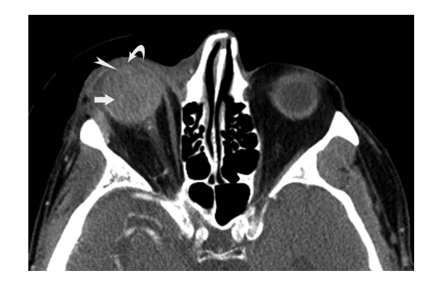
FIG 3. CT image shows a grade III posterior segment hemorrhage ( arrow ) in a 77-year-old man with right-sided open globe injury after blunt force trauma. The image shows intraocular hemorrhage that was too dense; however, the lens can be delineated from the hemorrhage ( arrowhead ) along with shallow anterior chamber ( curved arrow ). The right eye had a relative afferent pupillary defect with a measured intraocular pressure (IOP = 44 mm Hg) and a fractional increase in globe volume of 0.27.

Fractional Change in Globe Volume . Fractional increase or fractional decrease in the globe volume was obtained by using the contralateral normal globe volume as a reference (Fig 2). In patients with bilateral globe injuries, the mean volume of all the normal globes included in the study was used as reference.