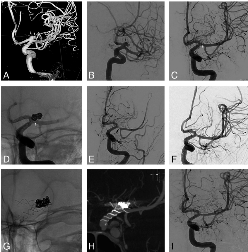
FIG 3. Procedural and follow-up angiograms of a 23-year-old male patient with unruptured bilateral ICA bifurcation aneurysms. Y-stent placement was performed as a bailout procedure after coil protrusion and consequent thrombus development following a single stent-assisted coiling treatment. A and B , Preprocedural DSA and 3D reconstructed angiograms show a wide-neck 6-mm aneurysm (arrows) located at the left ICA bifurcation. C and D , Procedural control DSA and nonsubtracted angiograms show that the aneurysm has been coiled with the assistance of a single LEO Baby stent extending from the ICA to the left anterior cerebral artery. The coil mesh (arrows) protrudes into the M1 segment of the MCA. E , A procedural DSA image reveals the development of a thrombus (arrow) in the M1 segment of the MCA. F , DSA image obtained after a bailout deployment of a second LEO Baby stent into the MCA, creating a Y-configuration with the first stent. As shown in the image, the deployment of the second stent successfully treated the coil protrusion and restored the patency of the MCA. G and H , Nonsubtracted angiography and an MIP reconstruction image of flat panel CT show the Y-stent configuration with 2 LEO Baby stents. The images clearly show that there is no constriction of the second stent (deployed into the MCA) at the intersection point of the stents. I , A 12-month follow-up DSA image shows complete occlusion of the aneurysm and the patency of the stents.

in both cases. The immediate control DSA images revealed total aneurysm occlusion (Raymond class 1) in 29 patients (72.5%), neck filling (Raymond class 2) in 10 aneurysms (25%), and sac filling (Raymond class 3) in 1 aneurysm (2.5%).