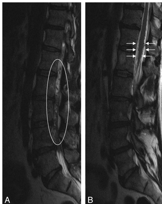
Fig 1. Sagittal T2-weighted images of the lumbar spine demonstrating multiple intradural flow voids (left, white oval), which appear on the surface of the conus (right, white arrows). No change in signal intensity was identified within the cord.

The L4-L5 neuroforaminal mass enhanced with contrast (Fig 2). MRA (Fig 3, left) of the lumbar spine demonstrated prominent intradural vessels contiguous with the mass with congested pial veins, compatible with a spinal arteriovenous fistula or arteriovenous malformation. Spinal angiographic examination was rec-