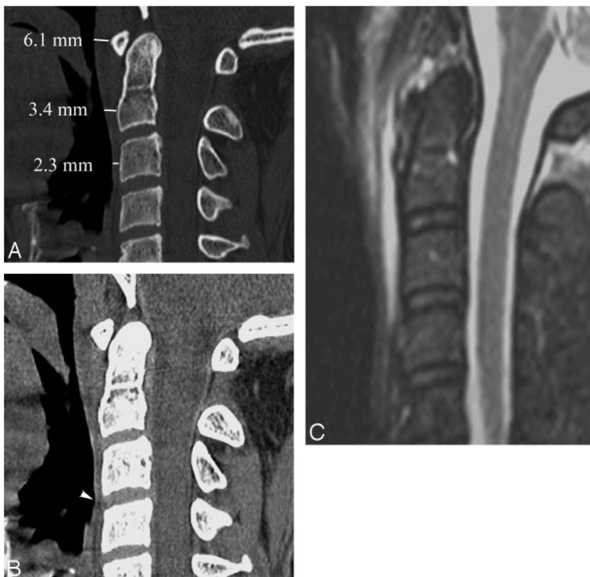
Fig 5. A 27-year-old patient after a motor vehicle crash with no osseous injury. A , Midsagittal MDCT image demonstrates normal PVST thickness by using normal values based on MDCT. B , Evaluation of the appearance of the PVST reveals subtle loss of the normal PVST fat plane above the inferior endplate of C3 ( arrowhead ). C , Correlation with short \tau inversion recovery MR image obtained the same day confirms the presence of edema and/or hematoma of the PVST accounting for the MDCT image findings.

Higher resolution MDCT scanners and current protocols allow a more detailed visualization of the PVST anatomy than was possible in the past. To evaluate the PVST appearance, we