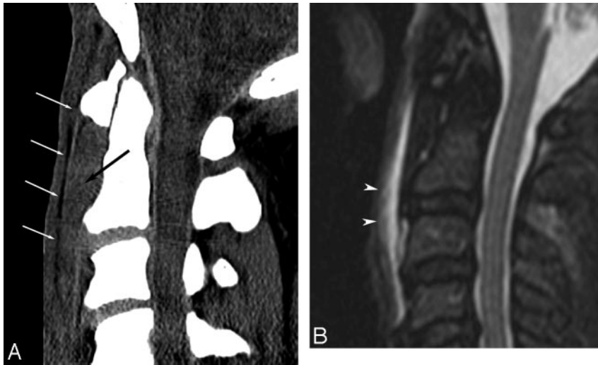
Fig 4. A 43-year-old patient after a motor vehicle crash with no osseous injury. A , Midsagittal MDCT image of the cervical spine demonstrates abnormal high attenuation ( black arrow ) anteriorly displacing the retropharyngeal fat plane ( white arrows ). B , Short \tau inversion recovery MR image obtained the same day shows extensive PVST edema and/or hematoma in this region ( arrowheads ).

the air column, we performed the measurements on MDCT images at the midanterior vertebral body point to avoid confusion when reproducing these measurements in patients with degenerative disk disease and prominent osteophyte formation. Although the shape of the anterior vertebral body can vary to a certain degree between patients (ranging from concave to convex), in our experience, thickening of the PVST is greater at the levels of the midanterior vertebral body than it is at the regions anterior to osteophytes. For this reason, the measurements were performed at the midvertebral level and not at the endplates.