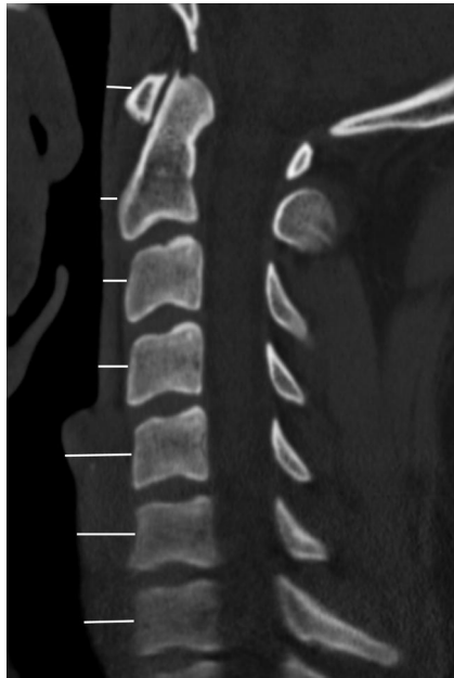
Fig 1. Midsagittal MDCT image of the cervical spine illustrating the method used to measure the thickness of the PVST.

3-mm thickness every 3 mm through the entire spine. A 16-cm FOV, 512 \times 512 matrix, 140 kV, and 250 mAs were generally used; however, these factors were sometimes altered to accommodate a patient's body habitus. Patients were scanned in a "near-neutral" position with a cervical collar in place. Examinations selected for inclusion in this study were free from motion artifacts and allowed the measurement of the PVST thickness from C1 to C7 in the FOV. The images were analyzed by using a preset bone window with a window level setting of 450 HU and a window width setting of 1700 HU.