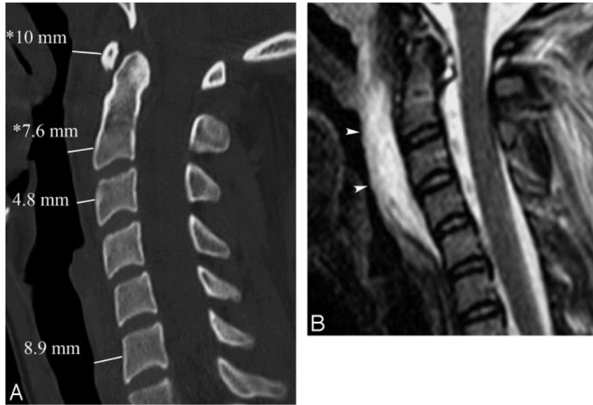
Fig 2. A 24-year-old patient after a motor vehicle crash with closed head injury; no fracture was identified in the cervical spine or craniocervical junction. A, Midsagittal MDCT image of the cervical spine demonstrates abnormal PVST thickening at C1 and C2 (asterisks). B, Correlation with midsagittal short \tau inversion recovery MR image obtained the next day confirms the presence of extensive PVST edema and/or hematoma in this region (arrowheads).