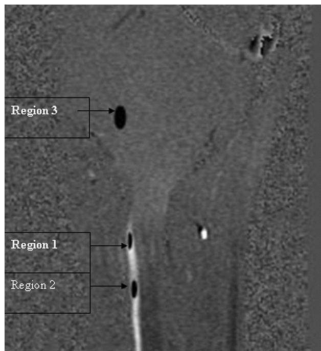
Fig 1. Regions of interest. Region 1 is seen immediately below the foramen magnum, and region 2 is seen at the C2–3 intervertebral disk level. Region 3 is placed on the pons away from the foramen magnum for background subtraction.

(recognized as a sharp transition of pixel intensities) was detected by the technologist at the time of imaging. The encoding direction was head to foot in all patients. Phase-contrast images were obtained at each of a total of 32 time points, equally spaced over the cardiac cycle. The total imaging time was dependent on the patient's heart rate and varied between 4 and 7 minutes. The patients were instructed to breathe normally during the flow imaging.