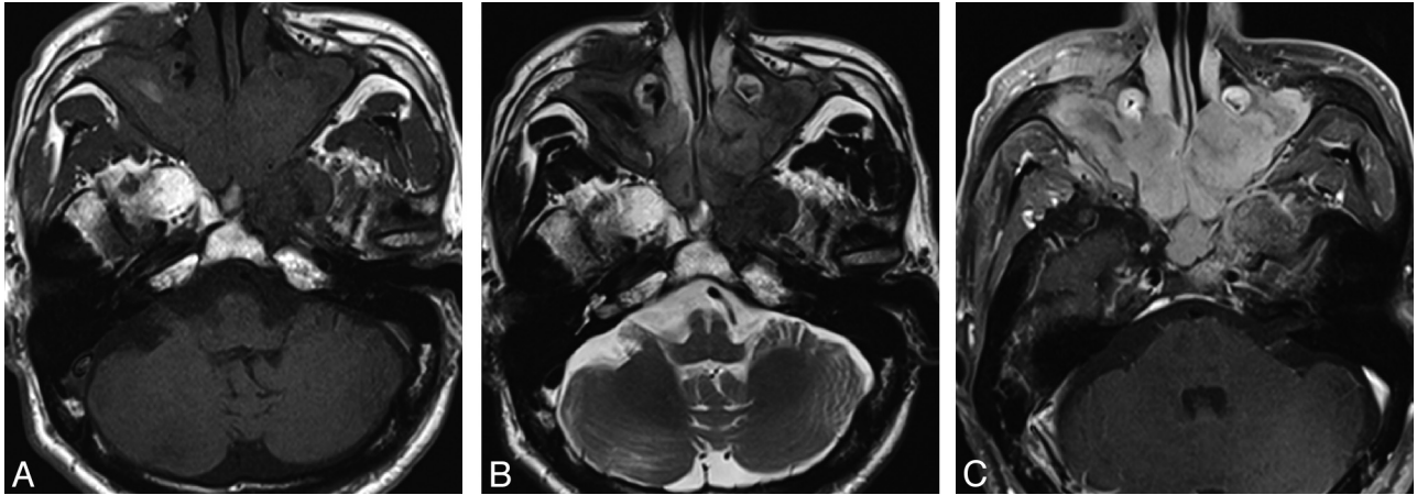
Fig 1. MR imaging of a mass in the nasal cavity and both maxillary sinuses. A , T1-weighted image shows a mass of intermediate intensity compared with muscle and high-intensity areas in the right maxillary sinus. B , Slight hyperintensity is seen on the T2-weighted image. C , Fat-suppressed T1-weighted image has homogeneous gadolinium contrast enhancement.