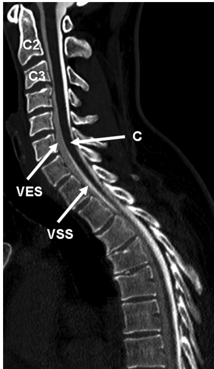
FIG 1. Sagittal postmyelogram CT of the cervical and upper thoracic spine showing a ventral epidural contrast collection. VES indicates ventral epidural space; VSS, ventral subarachnoid space; C, cord.