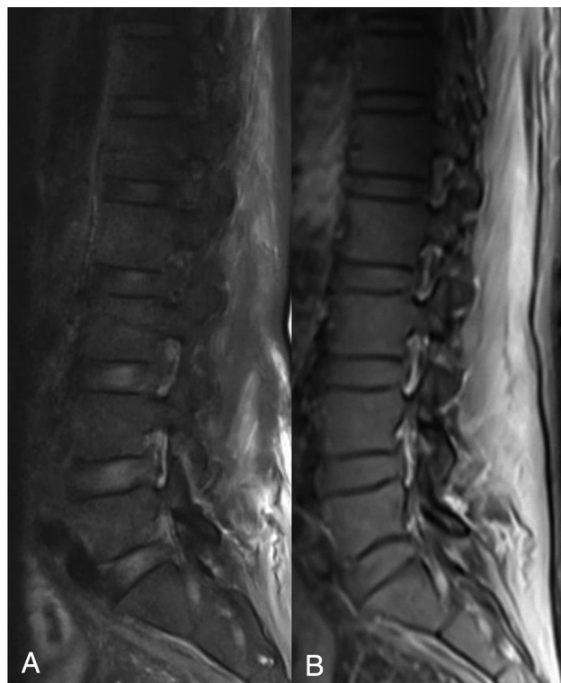
FIG 1. A 56-year-old man with COVID-19. A, sagittal fat-saturated T2-weighted image of the lumbar spine demonstrating increased T2 signal intensity within the posterior paraspinal muscles. B, post-contrast fat-saturated T1-weighted image of the lumbar spine demonstrating diffuse enhancement within the posterior paraspinal muscles.

recorded in reference to the vertebral body level for each patient. Indications for spine MR imaging included a report of back pain in 5 patients, bilateral leg pain in 2 patients, imbalance in 1 patient, and 1 patient who was found unconscious after a suicide attempt.